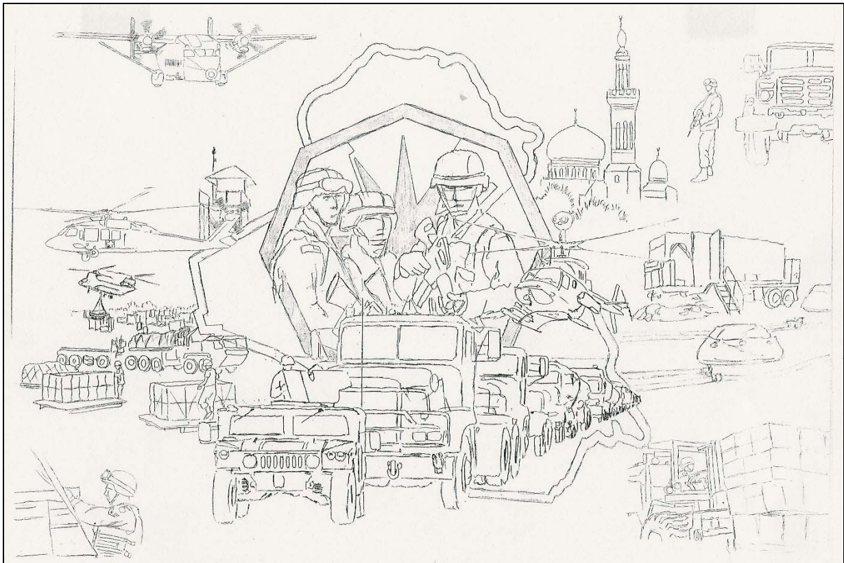
Black and White Artist Concept Sketch Actual size 18' x 24" in full-color